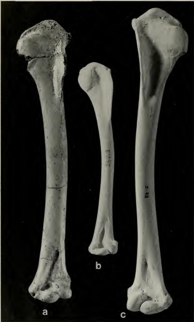
Fig. 3. Humeri in cranial view. a, Balearica rummeli (Mlikovsky), left humerus, holotype, Michael Rummel collection, n° 3/21.0001. b, Tyto alba , recent, left humerus, Collection UCB, Lyon, n° 245-3. c, Balearica pavonina , recent, right humerus, Collection UCB, Lyon, n° I-73. a and c, natural size, b 1.5 × natural size.